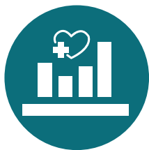
Predict CARE scores